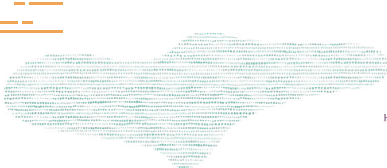
Figure 5: Step 11-12 Worksheet Sample

Now you have built a dynamic model using best practices that automatically calculates gross and operating margins as you change assumptions. While this is a basic model, it's one of many that can help you set goals and make decisions for your company. It quickly gives you an idea of what your finances would look like based on projected revenue and expenses, and you could create multiple versions based on expected, high or low sales estimates.